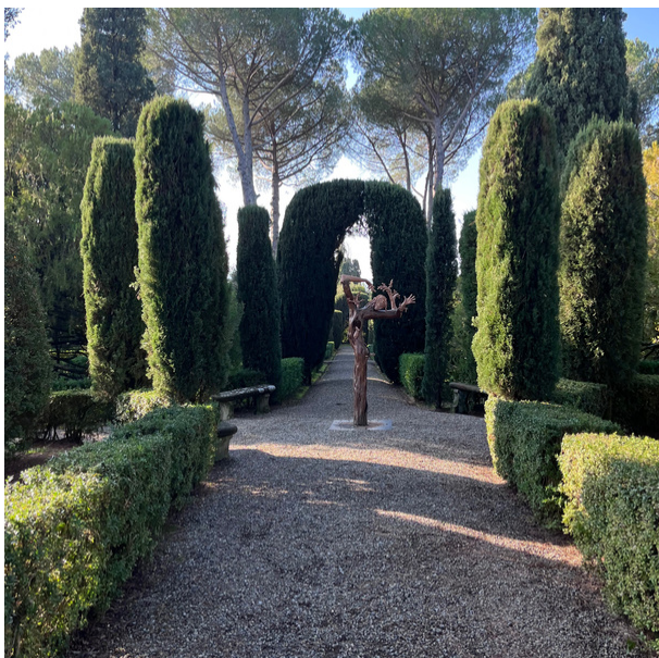
Mirra and the birth of Adone

The garden was born in 1932 thanks to Franco Venerosi Pesciolini who replaced the ancient orchard (pomaio) planted by the family at the end of the nineteenth century, designed according to medieval models, with a garden that he wanted realized according to the archetype of Italian gardens typical of the Renaissance. Surrounded by large holm oak trees, it stands out for its unusual trees, for examples of topiary art and for a magnificent green telescope made up of arched cypresses placed in the center of the garden, which leads the visitor's gaze straight onto a terracotta sculpture of the 19th century representing the goddess Pomona, in memory of the ancient orchard. The walk in the gallery of holm oaks and every corner of the garden is very suggestive, it spreads atmospheres of intimacy and romance.